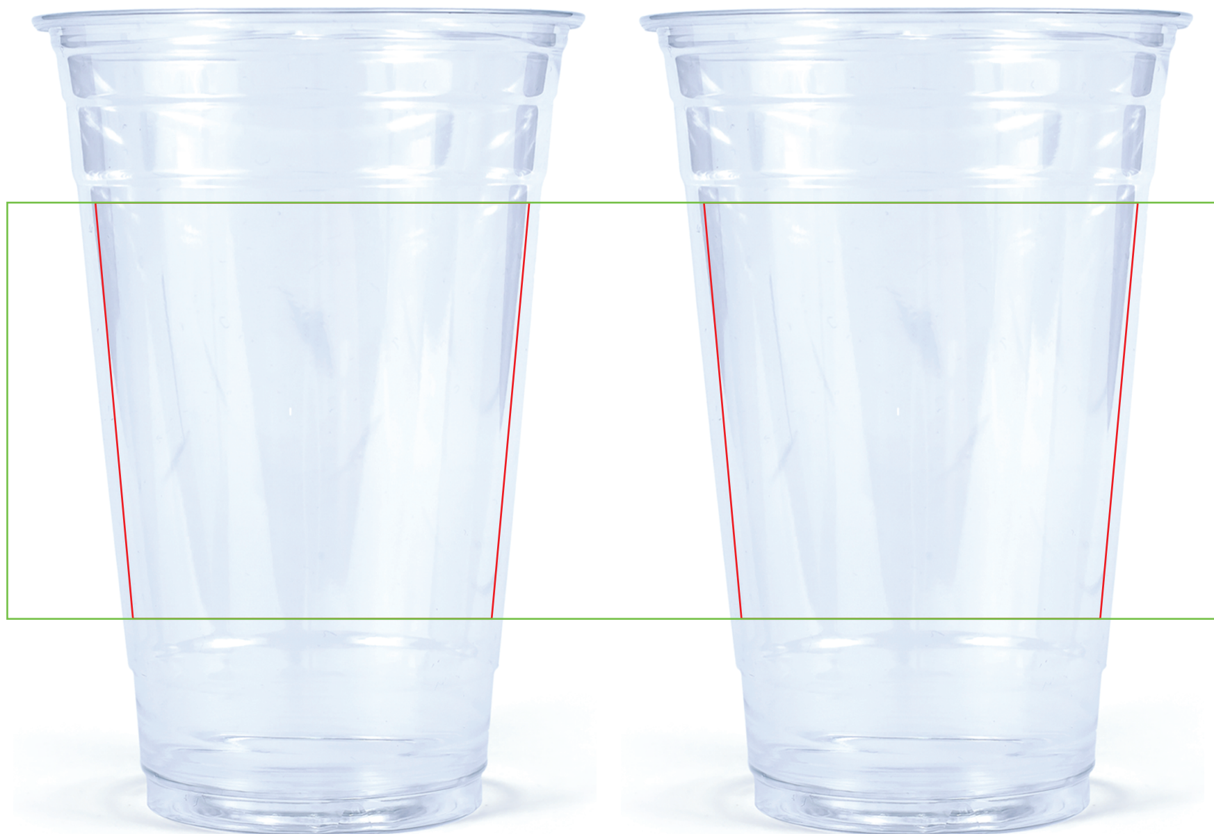
FRONT FRONT COLORS

Full Color Print 1 or 2 Sided Print & Full Wrap Largest Print Area