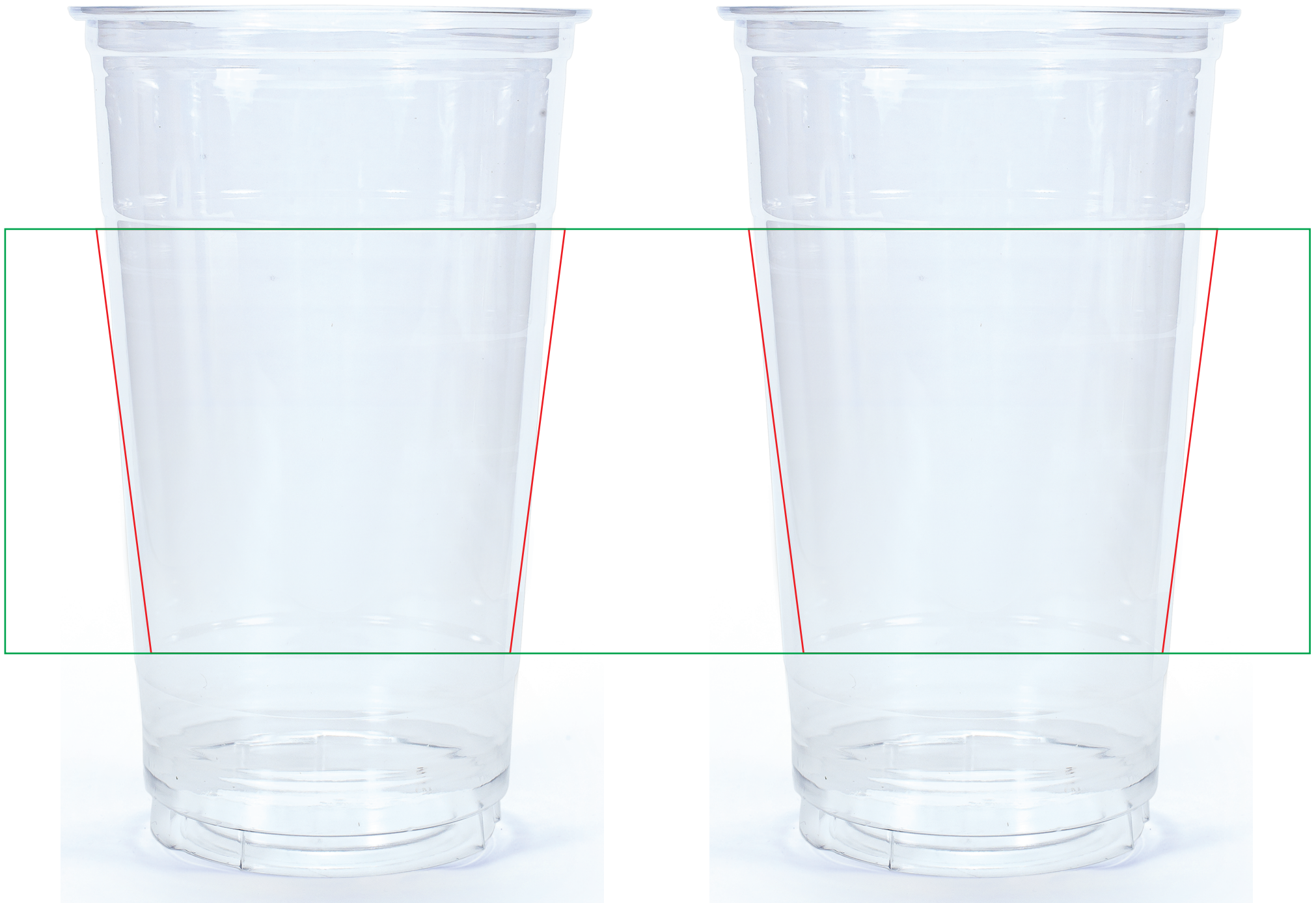
FRONT FRONT COLORS

Full Color Print 1 or 2 Sided Print & Full Wrap Largest Print Area